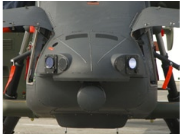
FLIR 111 on a Tiger helicopter

For more information please email sales.marketing@selexgalileo.com