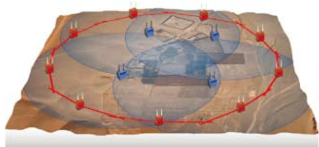
Hydra network sensing scenario

The figure above shows remote sensor nodes deployed to provide detection and identification of targets approaching a key asset or forward observation base. The outlying ring of sensors provide initial perimeter protection utilising PIR nodes.