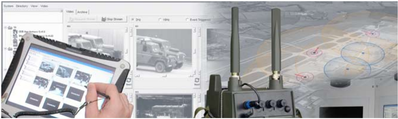
Imaging sensors nodes allow real-time video streams to be remotely viewed from visual band and Infrared cameras