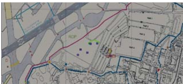
HYDRA situational awareness tool

Alternatively, Hydra's standard camera interface allows virtually any imaging device to be used with the imaging sensor node. This allows customer's existing inventory equipment to be interfaced with no modification required.