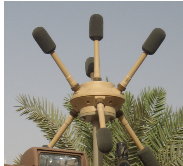
Sniper Detection System sensor mast

The Sniper Detection (or Shot Detection) capability provides a 75m acoustic bubble around the vehicle. Any small arms projectiles entering this bubble are detected by the system and both audible and visual warnings are given to the crew.