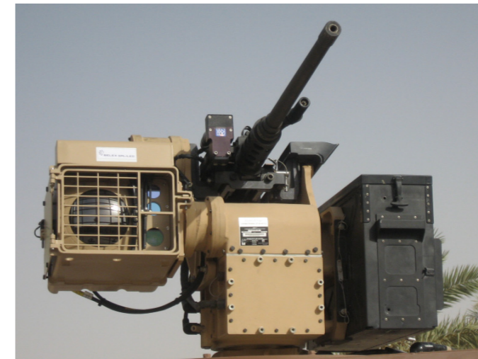
Remote Weapon Station

The integrated Remote Weapon Station is designed to be fitted to most military vehicles, and replaces older vehicle cupolas, to provide the crew with the ability to carry out long range surveillance and reconnaissance activities, and if required to engage targets under armour from the protection of the vehicle.