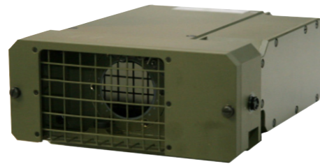
Sensor Unit with wiper

A range of displays/crew stations are available to suit the individual needs of the Driver, Commander and Crew and includes a "picture in picture" facility in the 10.4 inch display and a 10.4 inch PC based unit.