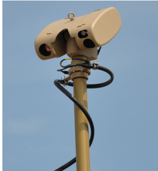
Long Range Surveillance Sensor