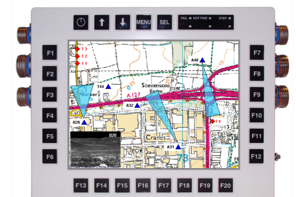
10.4" Crewstation with PC