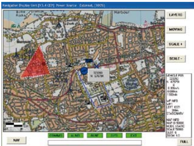
Navigation Display graphics

For more information please email sales.marketing@selexgalileo.com